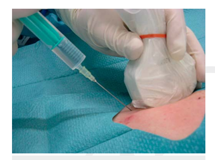
▶ Fig. 3 Correct application of the sterile ultrasound probe cover in a freehand biopsy with possible contact between the needle and the ultrasound probe. The examiner is wearing sterile gloves. A sterile drape/incise drape as a barrier precaution is obligatory when tools (e. g. syringe) must be changed/set down during puncture.