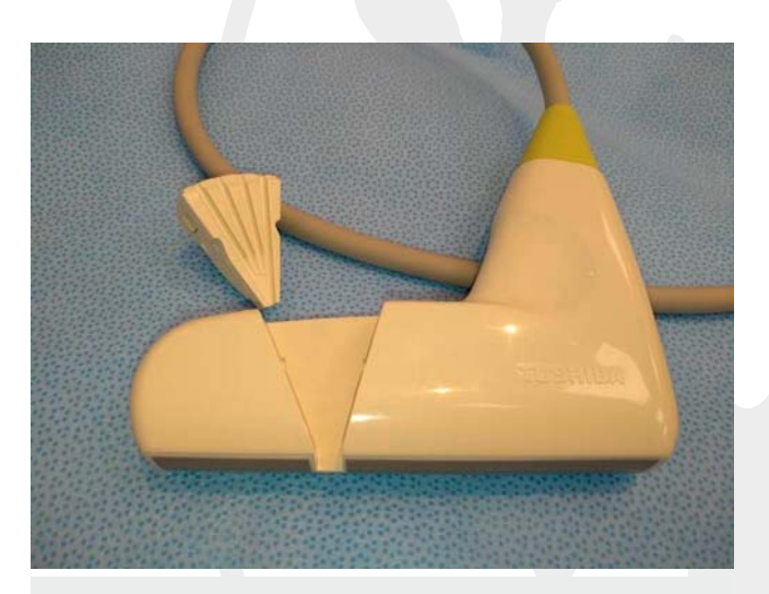
▶ Fig. 7 Ultrasound probe with puncture channel with removed needle guide. As a rule, these ultrasound probes and needle guides must be sterilized since the needle in the channel touches both parts.

In November 2014, the Regional Anesthesia Working Group of the German Society of Anesthesiology published its S1 guidelines, which require that the ultrasound probe and cable be covered with a suitable sterile cover in ultrasound-guided regional anesthesia. No differentiation is made between "single shot" and "catheter-based" regional anesthesia. Moreover, only sterile ultrasound gel or another sterile fluid can be used to improve image quality. In addition, all persons participating in catheter implantation must wear a surgical cap and a new surgical mask. In single-shot puncture, only a surgical mask is necessary. The sterile gown and surgical cap can be dispensed with [20].