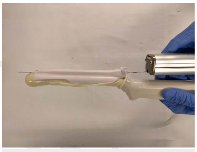
▶ Fig. 5 Rigid endoscopic ultrasound probe with puncture adapter. The ultrasound probe is first covered with a low-germ cover that is partially filled with ultrasound gel. The disposable needle guide is mounted over this.

As thermolabile devices, guide adapters that can be clamped to the ultrasound probe (> Fig. 6) are to be disinfected at least once and covered with a sterile cover. Injection needles and