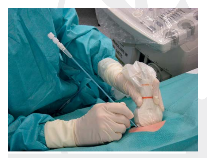
▶ Fig. 4 Placement of an abscess drainage tube. Ultrasound probe, cable, and keyboard are covered with sterile covers. Following hand disinfection, the examiner is dressed as in a surgical situation. A sterile drape/incise drape serves as the barrier precaution. A sterile ultrasound gel is used as the contact medium. A sterile work table is additionally available.

in the instructions for use. Proof of efficacy with recognized methods must be documented by an expert opinion (...)" [14]. This requirement was included in the ultrasound agreement in 2017 [36].