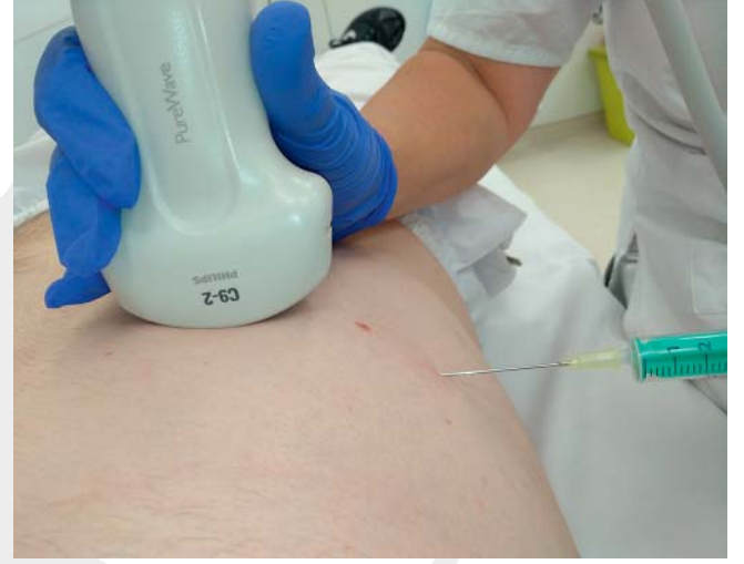
▶ Fig. 2 A safety distance between the ultrasound probe and the sterile needle is maintained in this freehand biopsy. If the examiner can ensure that the needle will not come into contact with the ultrasound probe, a sterile ultrasound probe cover is not necessary.

after every use is sufficient here. Disinfectants with only bactericidal and yeasticidal (yeast killing) activity are to be used.