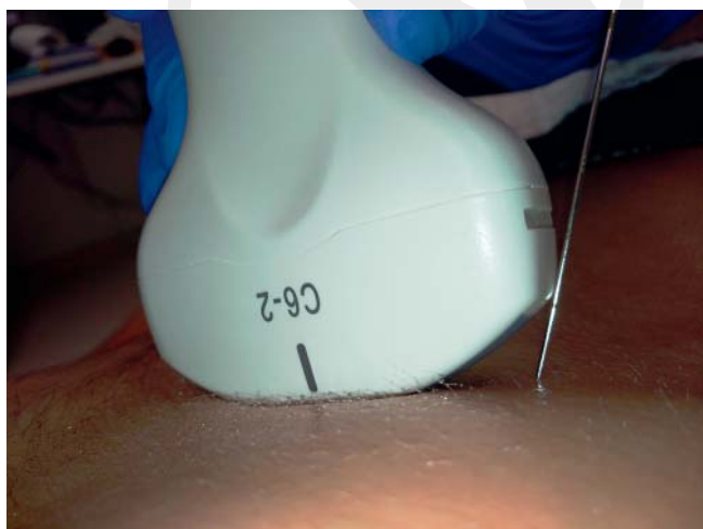
► Fig. 1 Incorrect puncture using the freehand technique with minimal needle distance from the ultrasound probe. The needle unintentionally comes in contact with the ultrasound probe that has only been disinfected. A sterile cover for the ultrasound probe would be needed in this case.