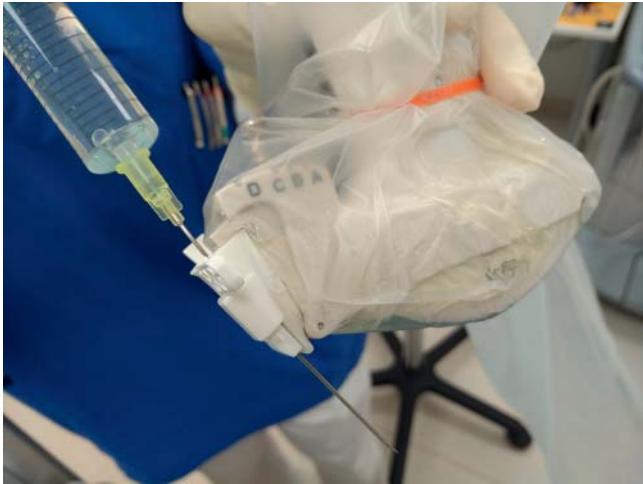
► Fig. 6 Ultrasound probe with puncture adapter. The guide adapter is attached to the ultrasound probe under the sterile cover. The sterile disposable needle guide is clamped on top. The ultrasound probe cover also covers the cable.