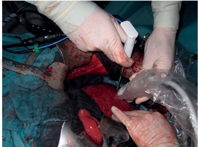
► Fig. 8 Intraoperative ultrasound with intervention. The sterilized ultrasound probe or probe treated with bactericidal (including mycobacteria), fungicidal, and virucidal immersion disinfection is packed in sterile packaging. The examiner is dressed like a surgeon.