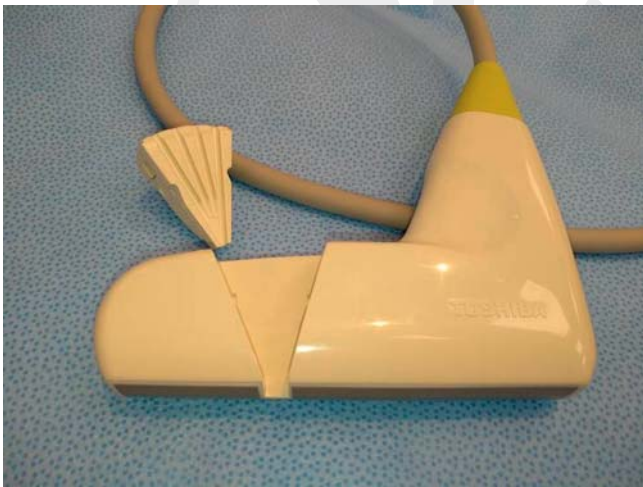
► Fig. 7 Ultrasound probe with puncture channel with removed needle guide. As a rule, these ultrasound probes and needle guides must be sterilized since the needle in the channel touches both parts.

In November 2014, the Regional Anesthesia Working Group of the German Society of Anesthesiology published its S1 guidelines, which require that the ultrasound probe and cable be covered with a suitable sterile cover in ultrasound-guided regional anesthesia. No differentiation is made between “single shot” and “catheter-based” regional anesthesia. Moreover, only sterile ultrasound gel or another sterile fluid can be used to improve image quality. In addition, all persons participating in catheter implantation must wear a surgical cap and a new surgical mask. In single-shot puncture, only a surgical mask is necessary. The sterile gown and surgical cap can be dispensed with [20].