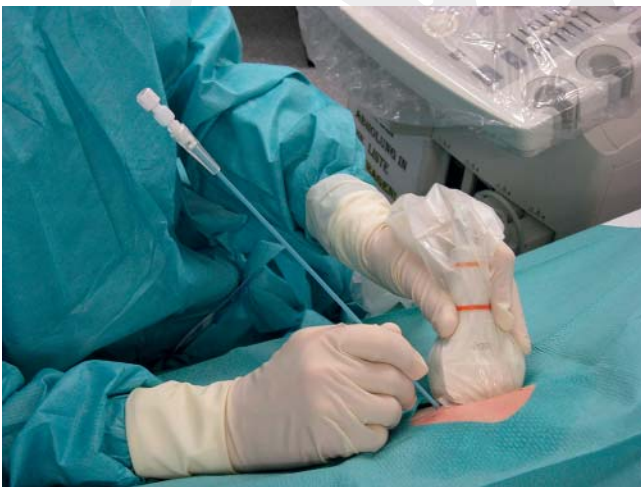
► Fig. 4 Placement of an abscess drainage tube. Ultrasound probe, cable, and keyboard are covered with sterile covers. Following hand disinfection, the examiner is dressed as in a surgical situation. A sterile drape/incise drape serves as the barrier precaution. A sterile ultrasound gel is used as the contact medium. A sterile work table is additionally available.

in the instructions for use. Proof of efficacy with recognized methods must be documented by an expert opinion (...)” [14]. This requirement was included in the ultrasound agreement in 2017 [36].