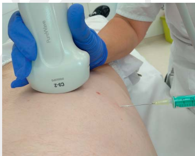
► Fig. 2 A safety distance between the ultrasound probe and the sterile needle is maintained in this freehand biopsy. If the examiner can ensure that the needle will not come into contact with the ultrasound probe, a sterile ultrasound probe cover is not necessary.

after every use is sufficient here. Disinfectants with only bactericidal and yeasticidal (yeast killing) activity are to be used.