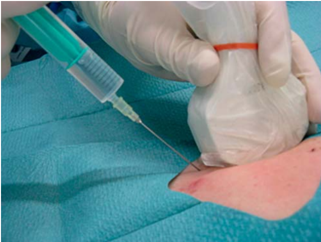
► Fig. 3 Correct application of the sterile ultrasound probe cover in a freehand biopsy with possible contact between the needle and the ultrasound probe. The examiner is wearing sterile gloves. A sterile drape/incise drape as a barrier precaution is obligatory when tools (e. g. syringe) must be changed/set down during puncture.